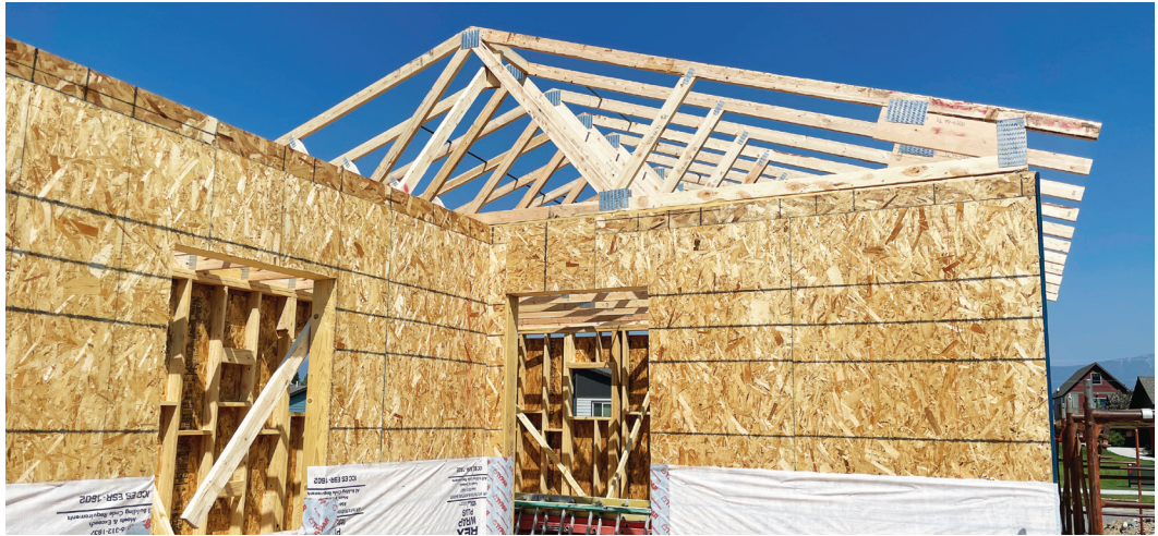
After much anticipation, the Ennis Habitat for Humanity sites are ready for volunteers to sign up.

To help at the Ennis sites, visit www.habitatbozeman.volunteerhub.com or call McLaughlin, at 406-388-8225.